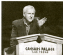
James Cameron would be the executive producer of the proposed iPort entertainment complex.

An atrium running through the center is called the "Media Canyon," which runs from the bottom to the top of the structure. Cameron and crew promise dozens of major attractions, rides (based on major motion pictures, including Cameron's "Titanic") that give the look and feel of the most advanced video games, and with dining and retail that keep with the cutting-edge theme. Two "video cyclones" that run from floor to ceiling and incorporate high-resolution LED technology are also planned.